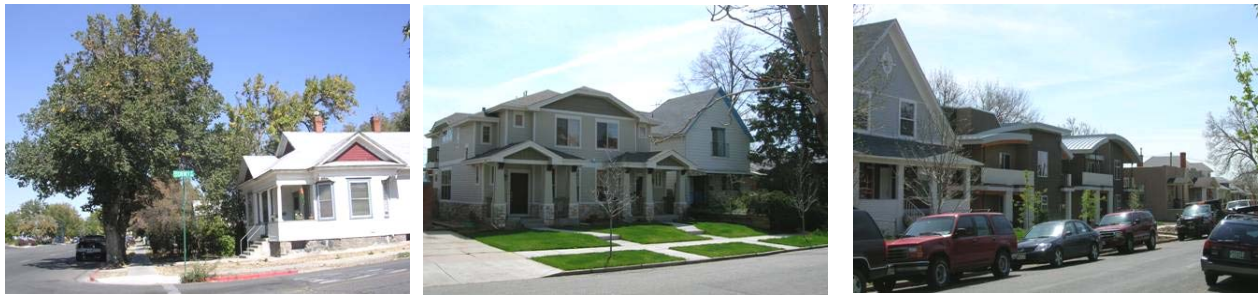
(Left) Traditional residential character found in many areas of the Wells Avenue Neighborhood. (Center/Right) Infill and redevelopment examples from an urban neighborhood in Denver, CO, demonstrating how new uses can be incorporated within a historic context, such as Wells Avenue.

Major renovations and infill development that is out of scale or character with the existing homes in a neighborhood can detract from the overall identity of the area. Wells Avenue Neighborhood residents value and wish to protect the historic flavor of their neighborhood. This can be accomplished, in part, through the creation and application of a set of design standards and guidelines, specific to the characteristics of the neighborhood that will help to ensure major renovation, infill, and redevelopment activities that create compatible structures that enhance, rather than detract, from the neighborhood.